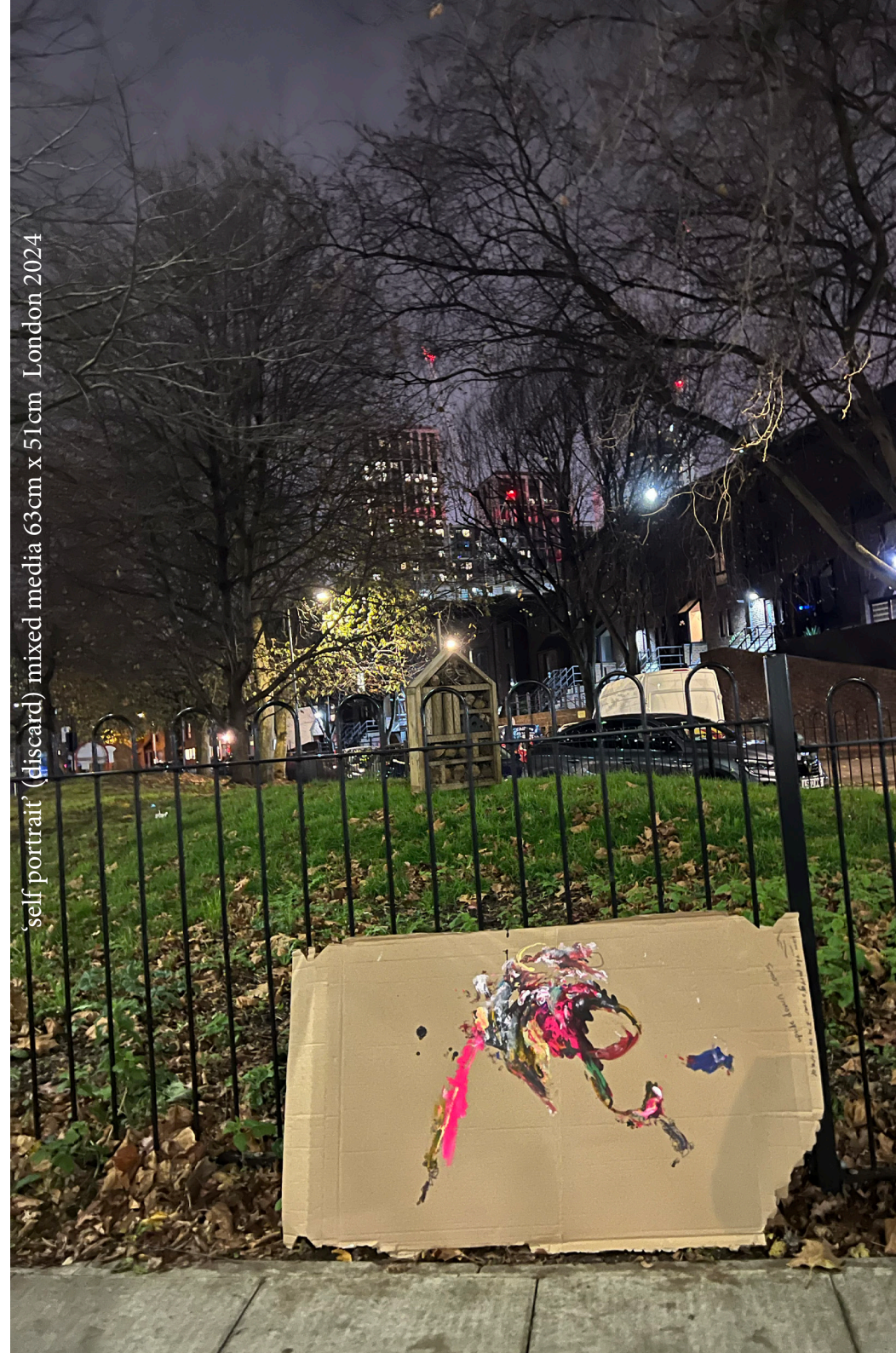
'self portrait (discard)' mixed media 63cm x 51cm London 2024