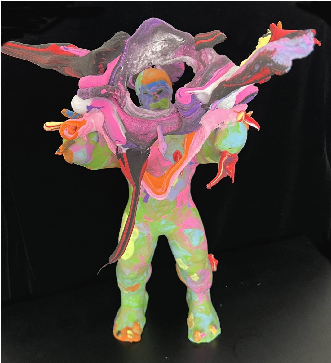
'a bit like love .....a bit like obsession' mixed media free standing 37cm x 17cm x 26cm