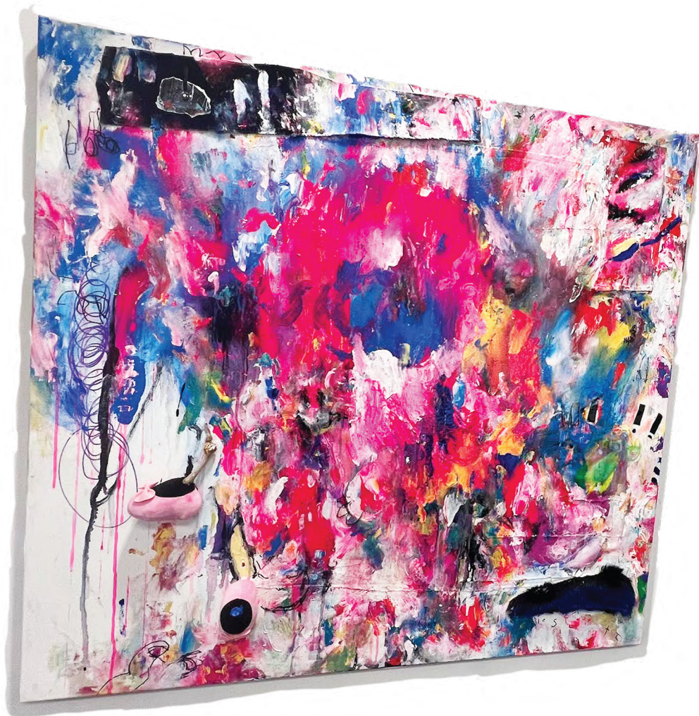
'a bit like love....a bit like obsession' mixed media on canvas 120cm x 120cm London 2024