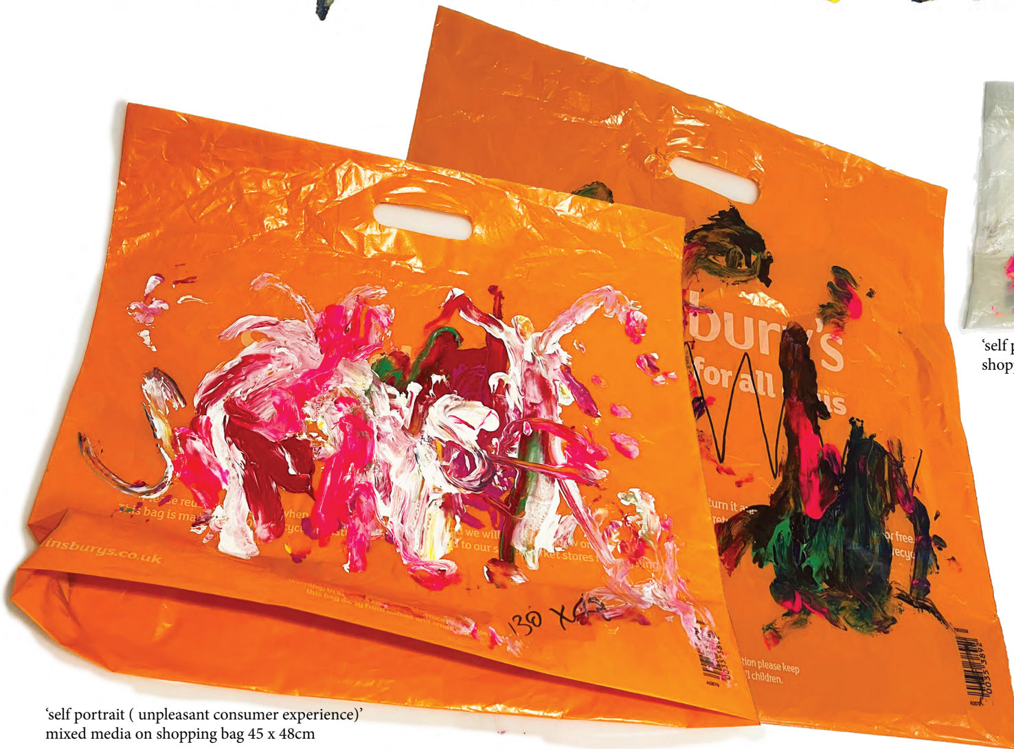
'self portrait ( unpleasant consumer experience )' mixed media on shopping bag 45 x 48cm