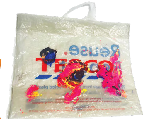
'self portrait ( empty bag )' mixed media on shopping bag 46 x 43cm