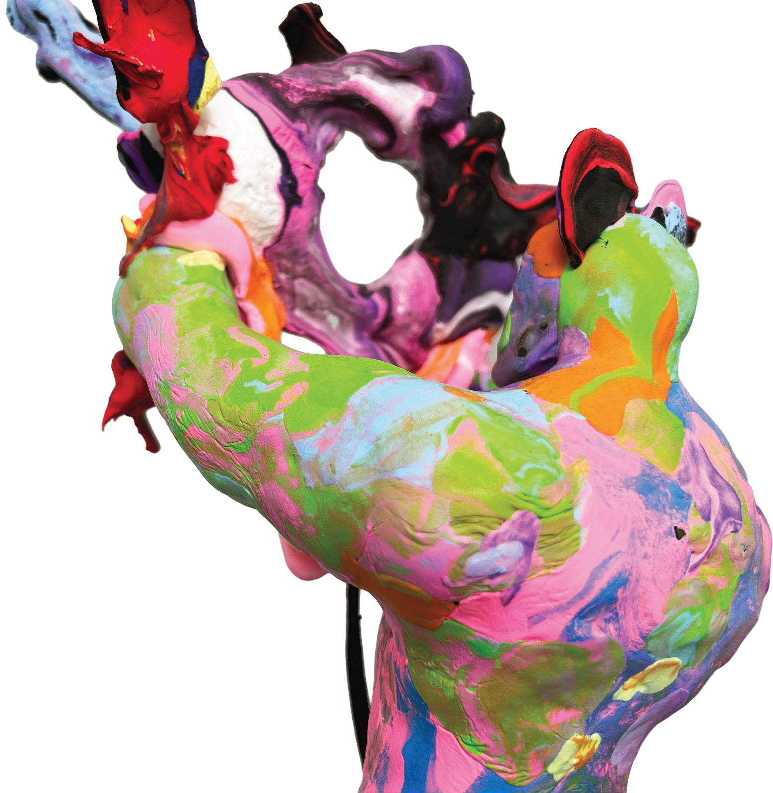
‘a bit like love....a bit like obsession’ (detail) mixed media 2025