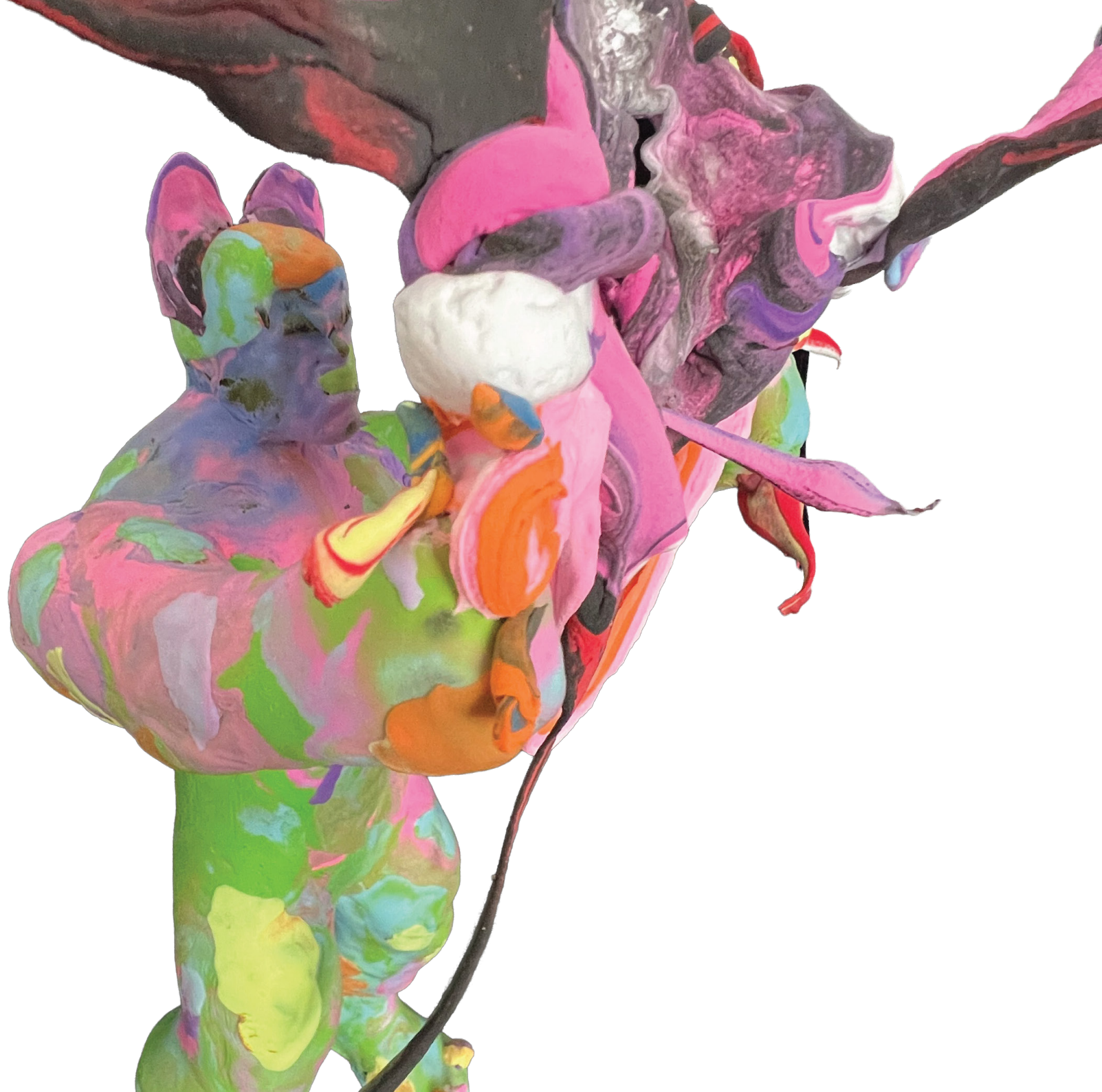
‘a bit like love....a bit like obsession’ 37cm x 17cm x 27cm (detail)