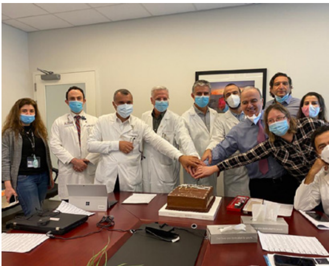
Averectal Study Enrollment Milestone