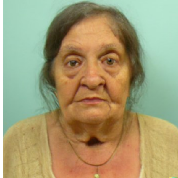
Figure 2: A novel image to illustrate clinical features of a common medical condition (hypothyroidism) produced using an AI text to image generation tool not based on a patient (Kumar et al 2024)