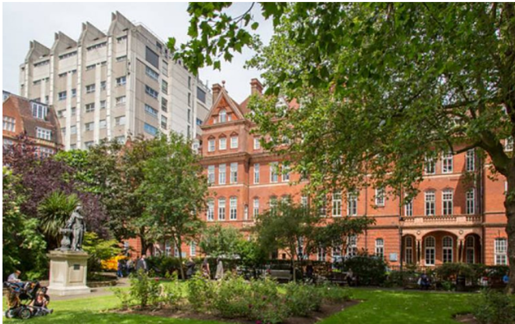
Figure 1: The Queen Square Institute of Neurology (on the left of image)

3 Senior administrator, Clinical Neurology by distance learning MSc/PG Diploma/ PG Cert at Queen Square Institute of Neurology, UCL