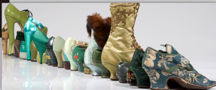
Northampton Museum and Art Gallery.

Our Forum gala dinner, at 7pm, will take place at the newly renovated Northampton Museum and Art Gallery , at the heart of our Cultural Quarter, 4-6 Guildhall Rd, Northampton NN1 1DP.