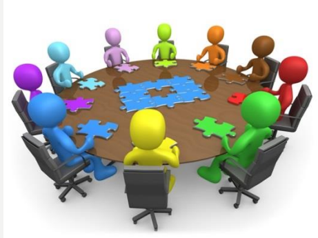
Group Work & Problem Solving Skills