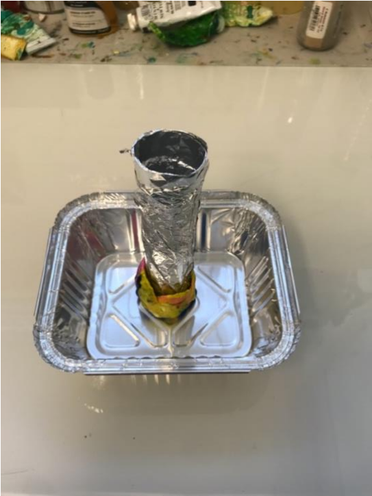
There you have it!

Pour carefully into the moulds, if wells form in the centre top up with more of the mix. Allow several hours to harden before removing the foil. I also put the mould inside a container in case of a leaking disaster. Very annoying to clean up afterwards, a friend told me 😬