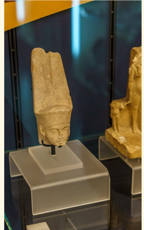
Limestone head of Min-Amun, Tutankhamun the Boy: Growing Up in Ancient Egypt display