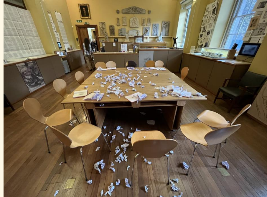
End scene of performative piece produced by The Place London Contemporary Dance School students, Oct 2022