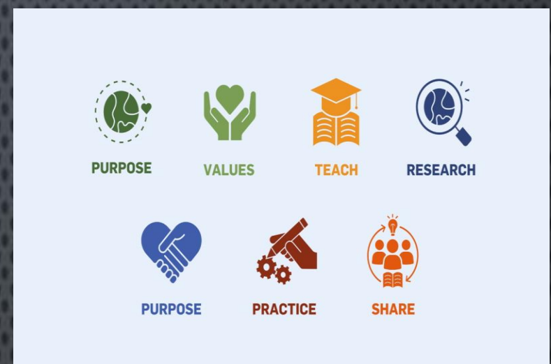
The seven principles- PRME