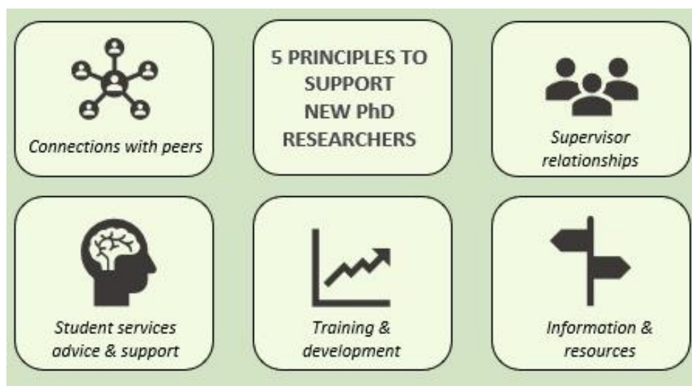
Figure 1: Principles for inductions to support doctoral researchers

This document outlines a set of strategies and key practices that can be used to inform the design of induction programmes in doctoral researchers. In line with calls in the higher education sector for the development of prevention strategies to promote mental health and wellbeing in doctoral researchers, we explored how to best support doctoral researchers in the transition to doctoral study. Funded by the Student Mental Health Research Network ( SMaRteN ), we worked with 47 doctoral researchers and 13 higher education stakeholders over a 9-month period to co-design principles to inform the design of doctoral researcher induction programmes. Combining the results of a systematic review (Jackman et al., 2021a) with qualitative data, we partnered with the study participants to develop guidelines that set out five key principles for higher education institutes to consider when developing doctoral induction programmes (Figure 1). You can read the full co-design paper online by clicking this link (Jackman et al., 2021b) .