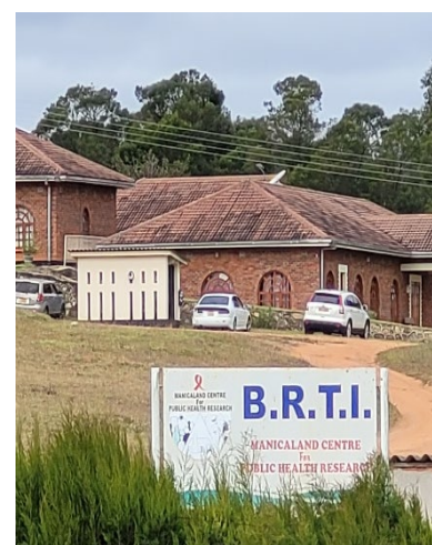
Biomedical Research & Training Centre (BRTI), Manicaland Centre, Eastern Zimbabwe