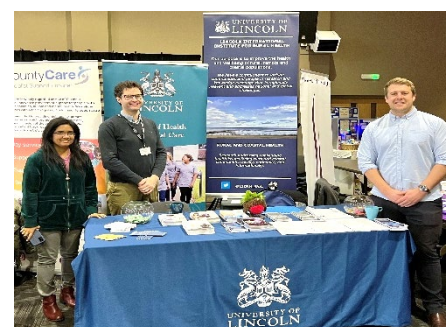
LIIRH stand, The Storehouse, Skegness