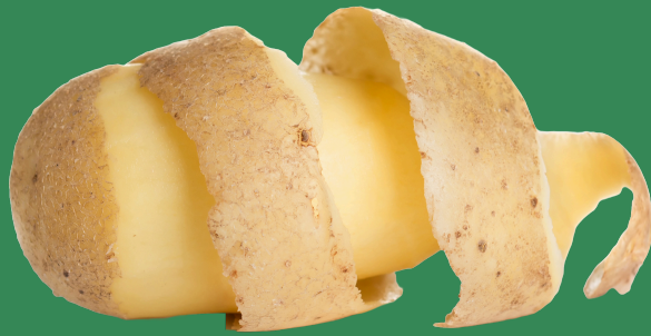
Fruit, vegetables and peelings

the following items can be put into the food waste bin: