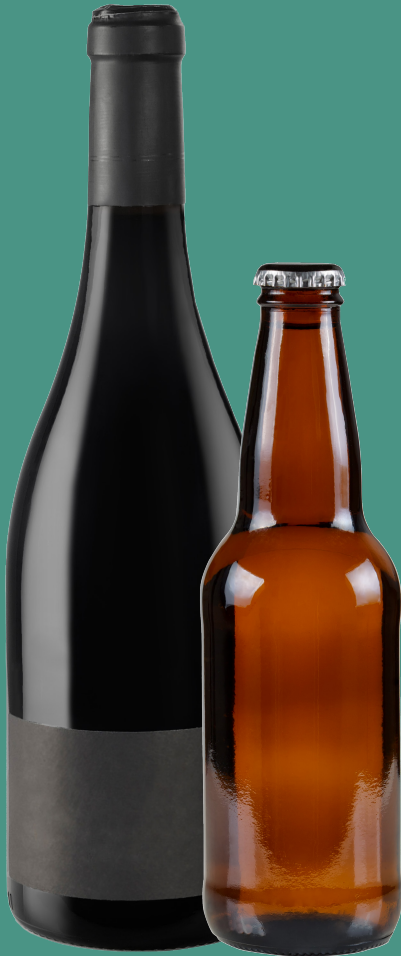
Clean glass bottles (all colours)

the following clean items can be put into the glass recycling bin: