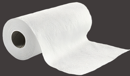
Paper towels/ tissues