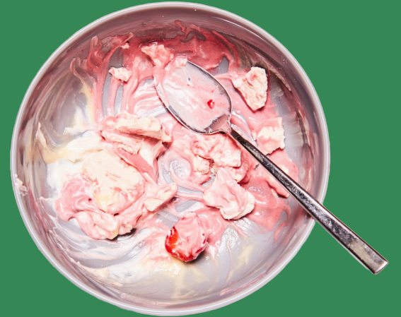
Leftovers, including plate scraps