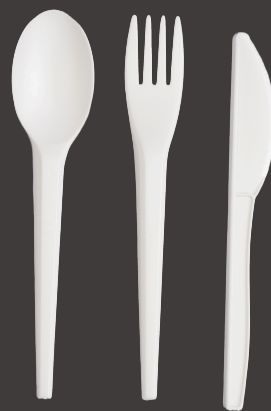
Single use cutlery/plates