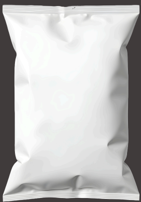
Empty crisp packets