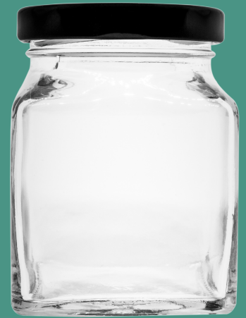
Clean glass jars (all colours)