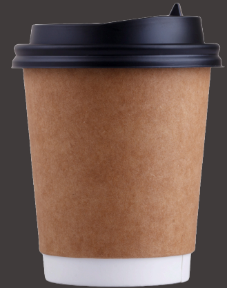
Single use coffee cups