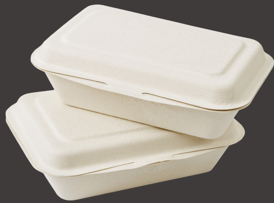
Single use packaging (compostable/polystyrene)

the following items should be put in general waste: