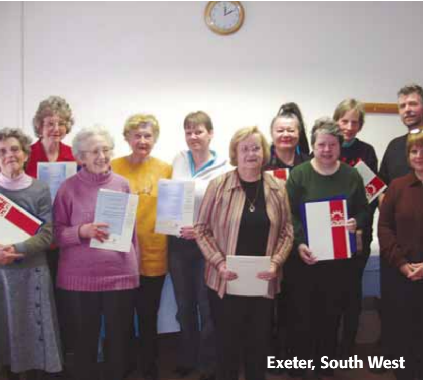
Exeter, South West