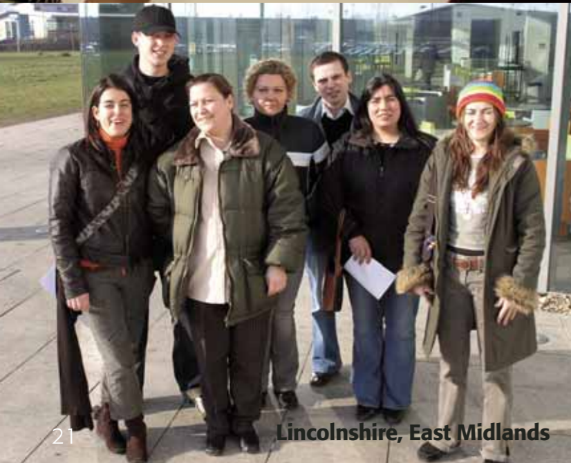
Lincolnshire, East Midlands

The Manchester hub's work includes the Gender and Community Engagement (GEM) project which carries out research and makes recommendations for gender balanced community engagements as well as developing and delivering gender awareness training. So for example, Asian women carried out research into barriers to Asian women's participation in local formal community engagement structures. The hub's work also includes a School for Participation and a Healthy Living Network which brings together local people to address health inequalities and promote healthy living. Recently a conflict resolution forum has developed. This works with parents who identify and research local community conflicts and practice conflict resolution skills in these local contexts. There are valuable lessons being learnt here about the benefits of participatory planning, learning, and evaluation. Lessons are being learnt about increasing the capacity for both individuals and groups to engage with local participative structures at neighbourhood, regeneration and local policy levels.