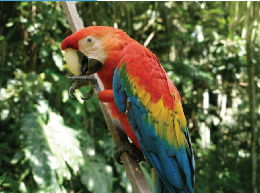
Figure 7: A scarlet macaw, one of the key tourist attractions in the Tambopata rainforest.

10,000ha of communally owned land, 2000ha of which are protected voluntarily (Nycander et al. , 2006). Hunting of wildlife considered a tourism resource, such as jaguars, harpy eagles and macaws, is prohibited on this land. Likewise, the community has committed not to fell trees in the areas designated for ecotourism (Nycander and Holle, 1996). There is an ongoing community