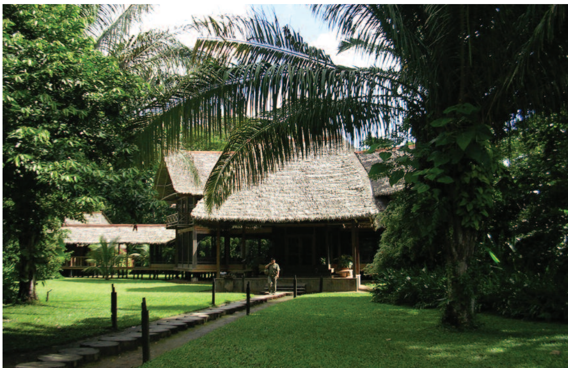
Figure 2: The reception building at Inkaterra's Reserva Amazonica Lodge.

Ecotourism in Amazonian Peru: uniting tourism, conservation and community development