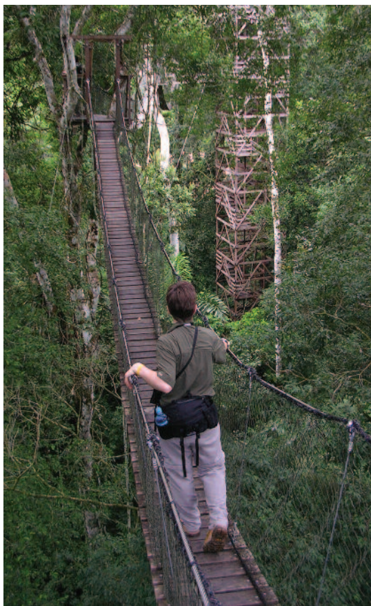
Figure 3: Section of canopy walkway close to Reserva Amazonica Lodge.

Lodge buildings (including 34 private cabins) are constructed from local materials in the traditional architectural style of the native Ese'eja Community. The buildings consequently have a low visual impact in the landscape (personal observation). The reception is thatched in the traditional style and includes a circular mezzanine, built around the trunk of a strangler fig, with balconies overlooking the Madre de Dios River and surrounding forest (Figure 2). To minimise energy use by visitors, no electricity is supplied to cabins, and kerosene lamps and candles provide lighting. Most cabins have cold water supplies and visitors are advised to use the resource sparingly (personal observation). Non-biodegradable tourist waste is taken off-site and organic waste is composted at the lodge or used as animal fodder by community members (CB personal communication).