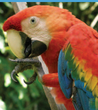
Figure 1: The Tambopata region in the Department of Madre de Dios, south-east Peru, showing the many tourist establishments in the area and their relationship to protected areas.

Tambopata National Reserve (TNR), created in 2000 with an area of 274,690ha, and the Bahuaja Sonene National Park (BSNP), first created in 1996 and subsequently extended in 2000 to an area of 1.1 million ha (Figure 1). Unlike National Park status, the National Reserve designation officially permits sustainable use of forest resources into the future (Matsufuji and Bayly, 2006). The TNR and BSNP together support 1300 bird species, 200 mammal species and approximately 10,000 plant species (INRENA, undated). The key attractions for tourists include relatively abundant populations of monkeys, macaws, giant river otters and harpy eagles.