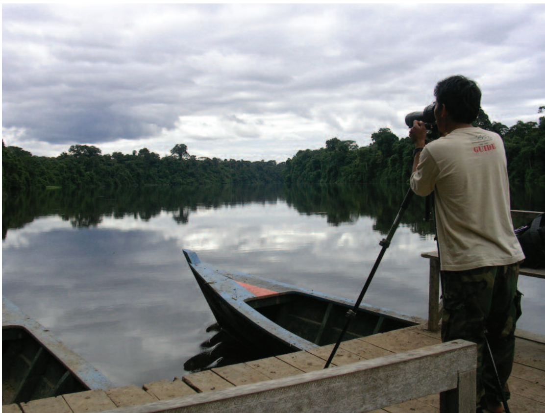
Figure 6: Wildlife observation from a manually powered raft on Tres Chimbadas Lake.