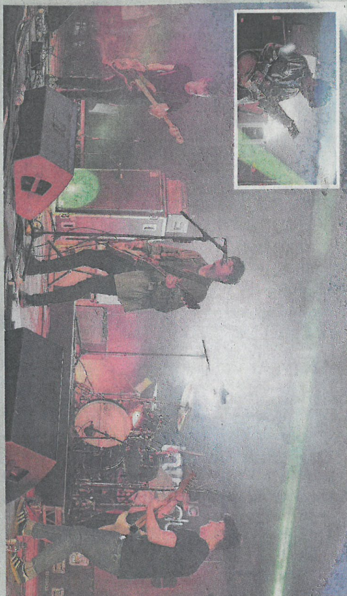
Merthyr Tydfil band Pretty Vicious play on the BBC Introducing stage at the 2015 Glastonbury music festival

Merthyr boys hit the stage at Glastonbury PRETTY Vicious were in a field of their own when they made a memorable headline appearance at the Glastonbury Festival at the weekend. More than 150,000 music fans packed out Worthy Farm in Somerset to witness performances from some of the biggest names in music including Pyramid Stage headliners Florence and the Machine, Kanye West and The Who. And several thousand of those rock 'n' roll aficionados were in attendance to witness the Merthyr band, who recently supported Manic Street Preachers in front of a sold-out 10,000 crowd at Cardiff Castle, play a memorable show headlining the BBC Introducing stage on Saturday evening. ■ Full story: Page 3