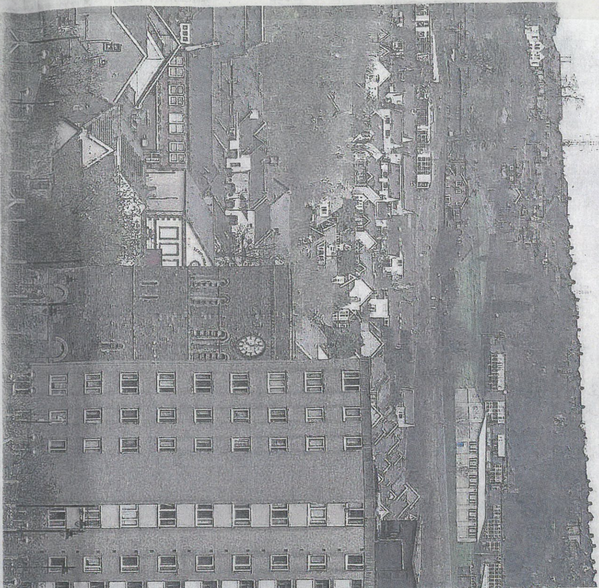
communities in Merthyr Tydfil