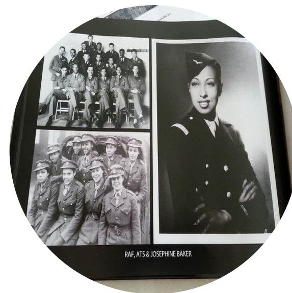
RAF, ATS & JOSEPHINE BAKER