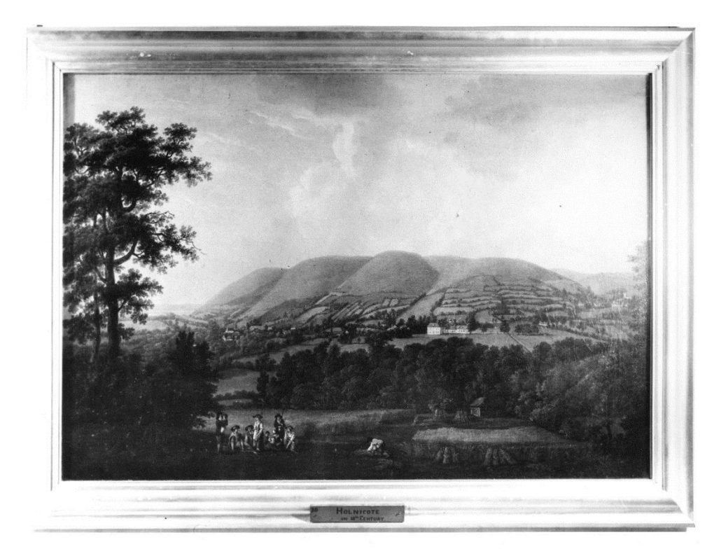
Eighteenth-century oil painting of the view from Luccombe to North Hill. Artist unknown.

Change in tree cover is particularly significant and visually apparent. The 10<sup>th</sup> Baronet, Sir Thomas Acland, known as 'the great Sir Thomas', planted thousands of trees on the southern side of North Hill, principally between 1810 and 1826. 23,000 were planted at Selworthy Plantation, 26,000 at Tivington and 25,000 at Holnicote (Ridler, 1983). Venn Plantation was added as an outlier to the existing Great Wood. This visionary act significantly impacted upon the landscape but, we argue, did not negatively impact upon the spirit of place of the estate as a whole for it kept the essence of place in mind. These changes are highlighted when comparing a mideighteenth century print (artist unknown) with Roger Miles's photograph of the same view in 1961.