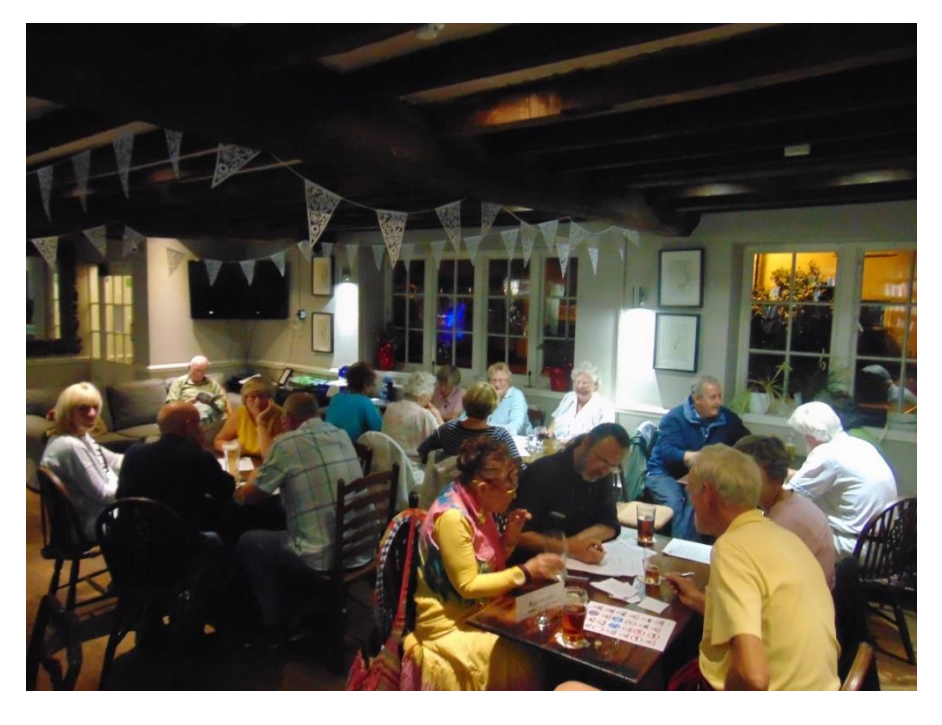
Local people and visitors taking part in the themed project pub quiz at The Castle, Porlock. 31<sup>st</sup> August 2016.