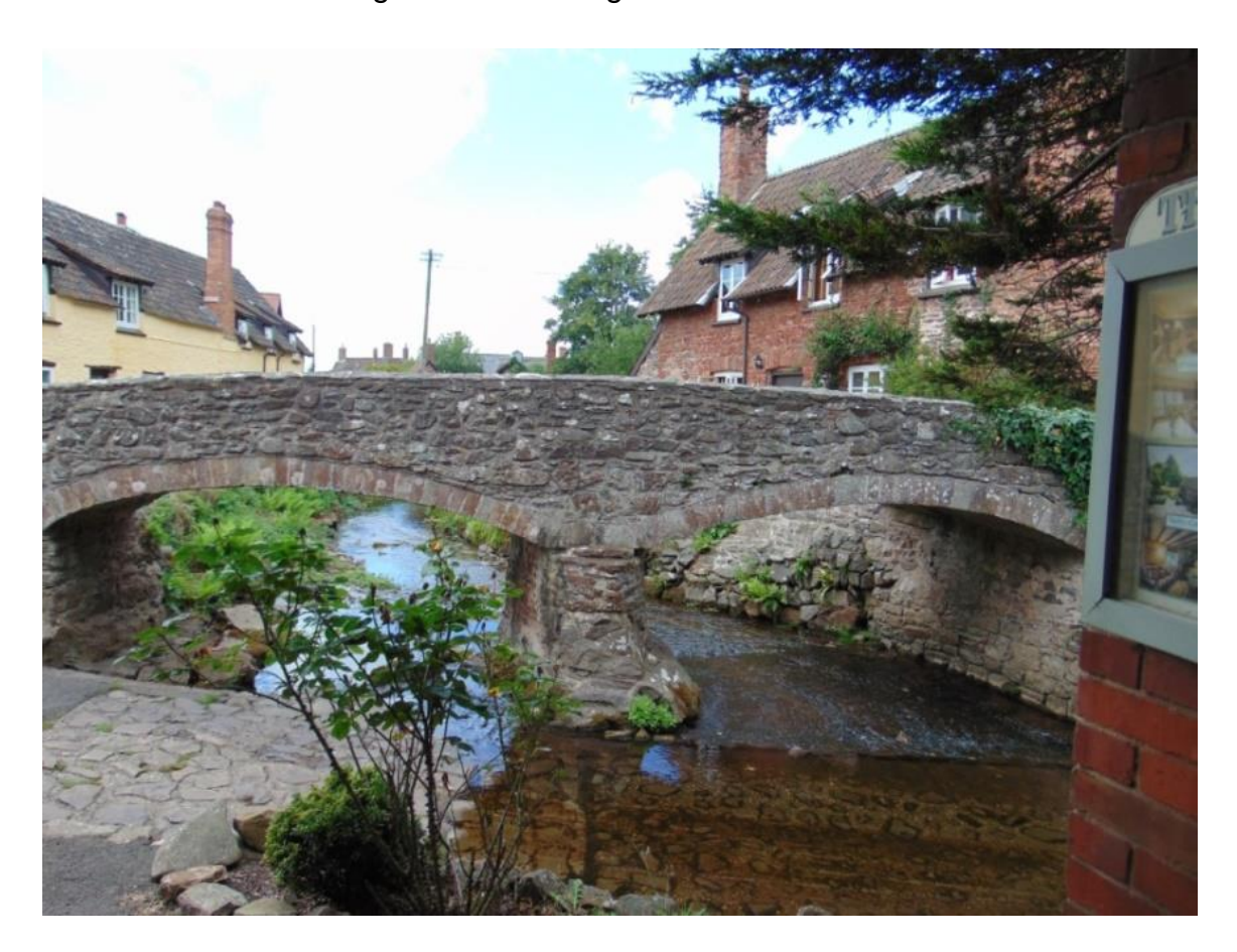
Packhorse bridge in Allerford.

annual dinner for the farmers organised by National Trust staff which helps maintain the bond between those who work on the estate. A wide range of local events, such as flower shows, fetes, barn dances and talks, illustrate (and foster) the close nature of the community. Tourism and farming are the two pillars of the local economy, and the estate itself is a magnet for attracting visitors.