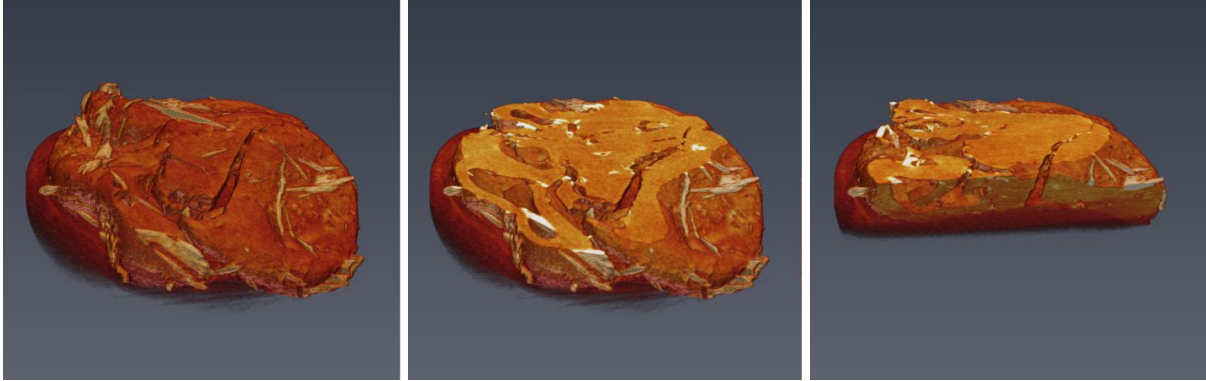
Figure 3. Three-dimensional rendering of the tetrad cryptospore.