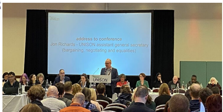
Higher Education Conference takes place every January.