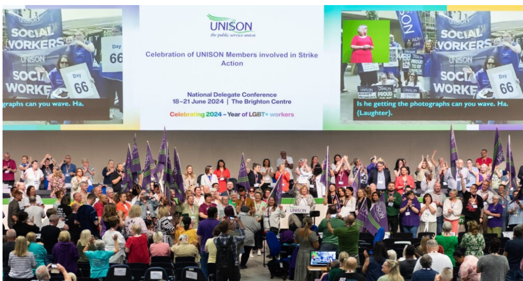
UNISON's National Delegate Conference 2024

Our branch has a Retired Members' Secretary and UNISON organises retired members regionally and nationally, with its annual Retired Members' Conference.