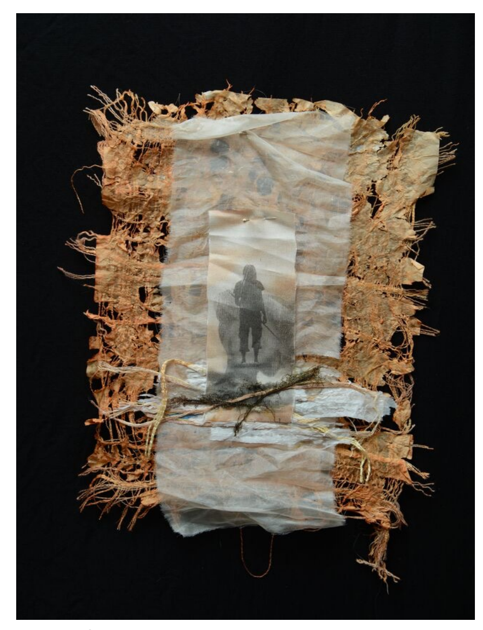
Hinds-Smith, Becoming a Memory, Mixed Media on Fabric Variable Dimensions, 2015.